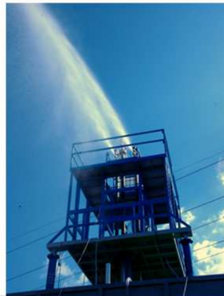
Low Head Turbines Water lifting & Wave Energy