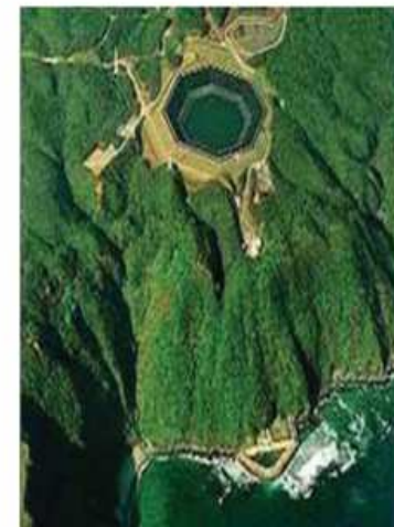
Low Head Turbines Water lifting & Wave Energy